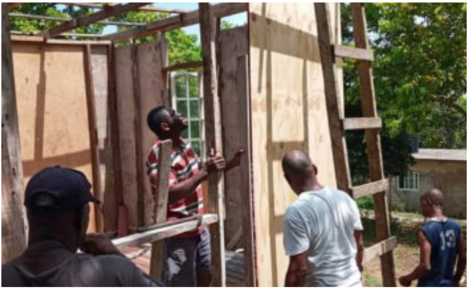
Members of the Spicy Hill Church in Trelawny build a house for a senior citizen of the community in November 2021.