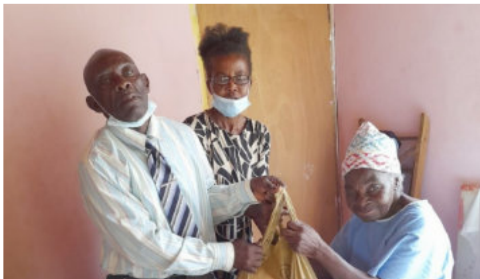
Members from the Adventist Church in Clarendon Park visited over 20 persons and distributed more than 20 care packages to the needy in the community.