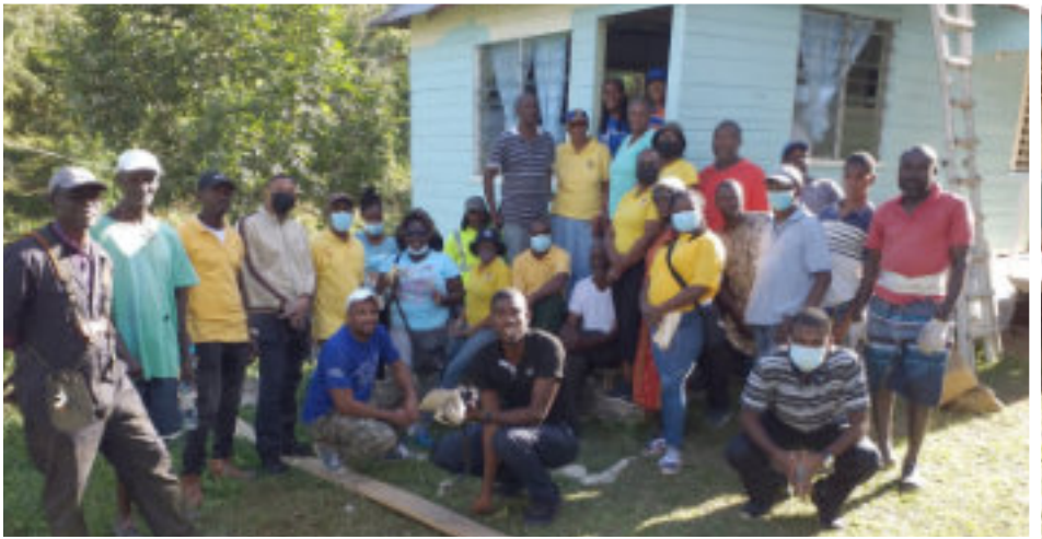
Members of the Westmoreland Youth Federation along with the Darliston District Federation pose with a senior citizen who was presented with the keys to his newly renovated home on February 6, 2022.