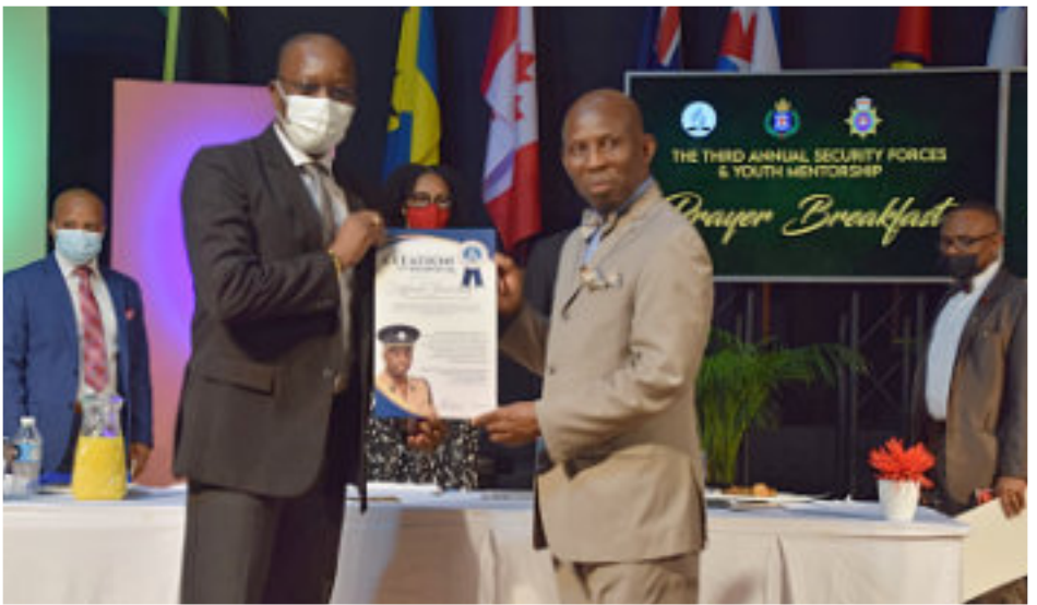
The West Jamaica Conference hosted its third annual Security Forces and Youth Mentorship Prayer Breakfast on Sunday, January 2, 2022. Members of the Jamaica Defence Force and the Jamaica Constabulary Force were engaged in a special devotional service, treated with breakfast, and shown special appreciation for their service.