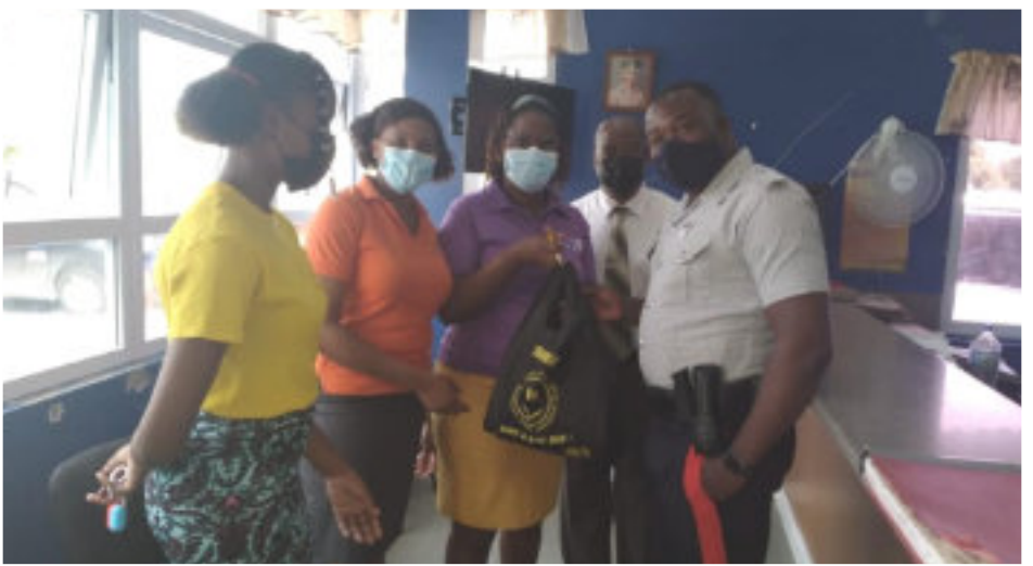
The members of the Seventh-day Adventist Church, Irwin, St. James, distributed Christian literature in the community, conducted blood pressure checks, visited the Police Station, and engaged in devotional activities with the citizens.