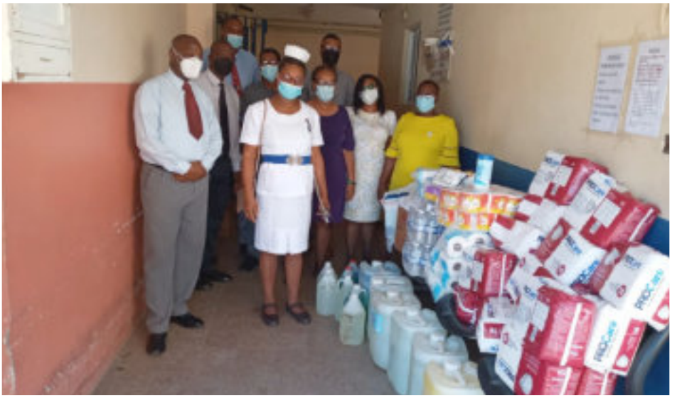
Members of the Adventist Youth Federation in St. Elizabeth donate well-needed supplies to the Covid-19 Isolation Ward at the Black River Hospital on Sabbath, October 2, 2021.