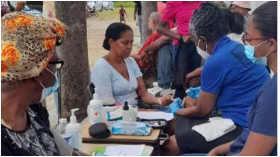
The West Jamaica Conference Medical Missionaries for the first time since the start of the Covid-19 Pandemic participated in a Health Fair, held at the Seventh-day Adventist Church, March Town, on Sunday, July 17, 2022.