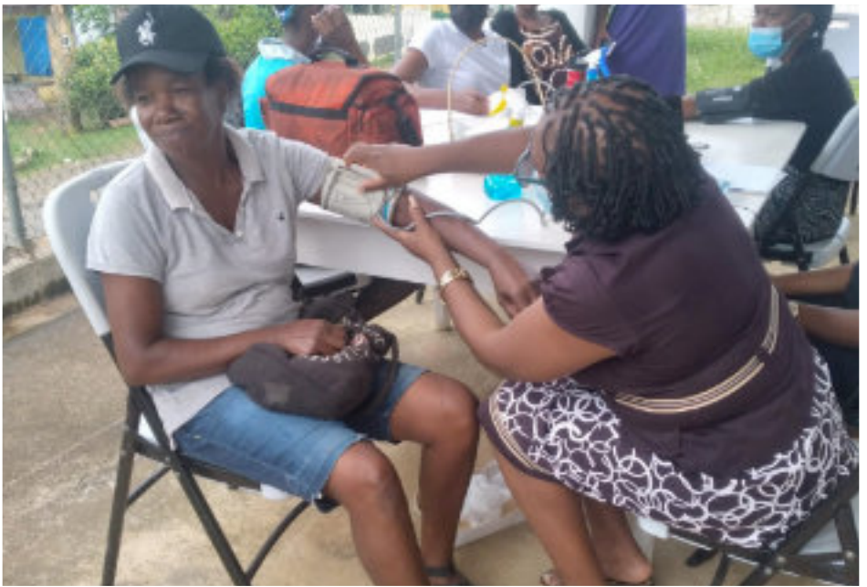
The Siloah team helped the community by performing blood pressure checks and having counseling sessions.