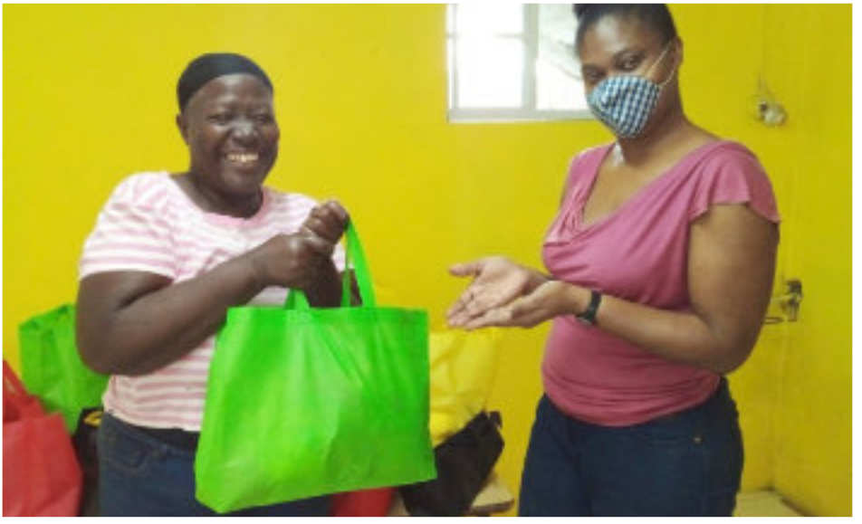
On December 26 and 27, 2021, members from the Seventh-day Adventist Church, Salt Spring gave back to their community in the form of hot meals and care packages. A total of 50 packages were distributed.