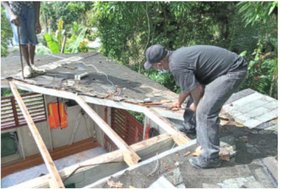
The Westmoreland Chapter of Men's and BEAMS continued their mission of serving others by taking on a house renovation project for a needy family on June 19 and July 1, 2022.